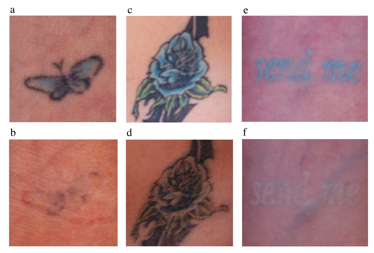
Fig. 1. Cross-polarized, digital images taken before (\mathbf{a}, \mathbf{c}, \mathbf{e}) laser treatment and after (\mathbf{b}, \mathbf{d}, \mathbf{f}) the 4th treatment. Purple, blue, and green pigment cleared almost completely, while some residual yellow and black ink are clearly visible. Cross-polarized photography enhances visibility of tattoos over conventional lighting or non-polarized flash photography.

compared to the 755 nm alexandrite and 532 nm KTP lasers. Because the 1,064 nm Nd:YAG wavelength is the longest available, it is also the least likely wavelength to target epidermal melanin pigment causing hypopigmentation, an unwanted side effect when treating tattoos. Black ink also tends to require more treatments compared